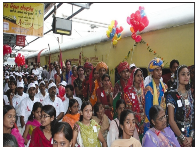
Figure 2: Mass mobilisation and awareness through Red Ribbon Express