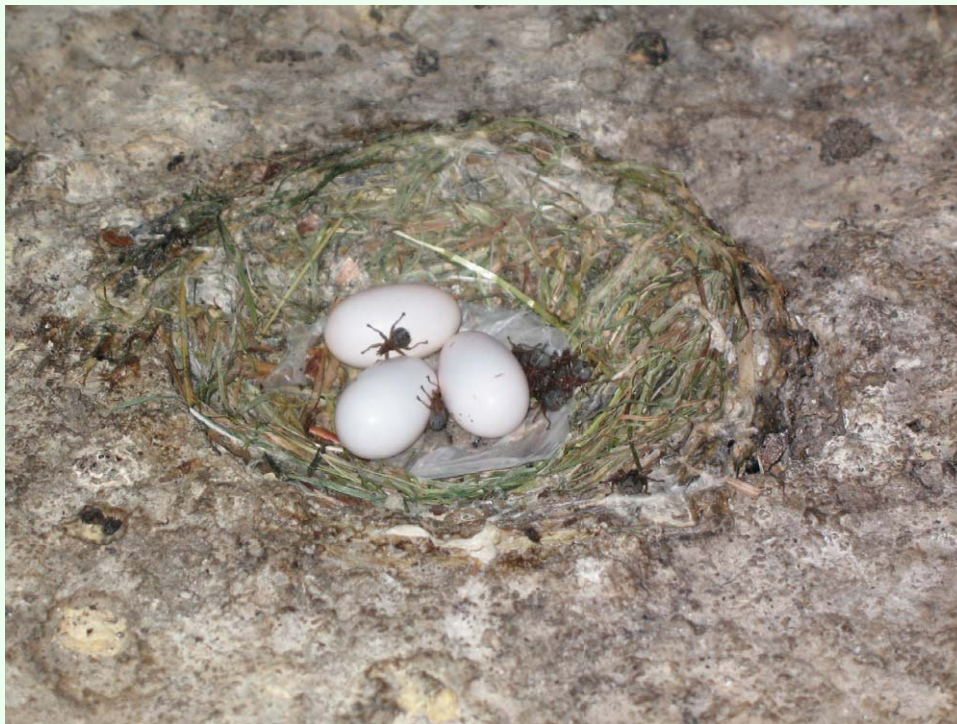
Figure 2. Adult Crataerina pallida at the nest during the incubation period of the Apus apus eggs. High quality figures are available online.

Adults emerged from 9 of the 20 pupae kept at room temperature between 27 April and 02 May, somewhat earlier than what would be expected. The group kept in the refrigerator hatched between August and October