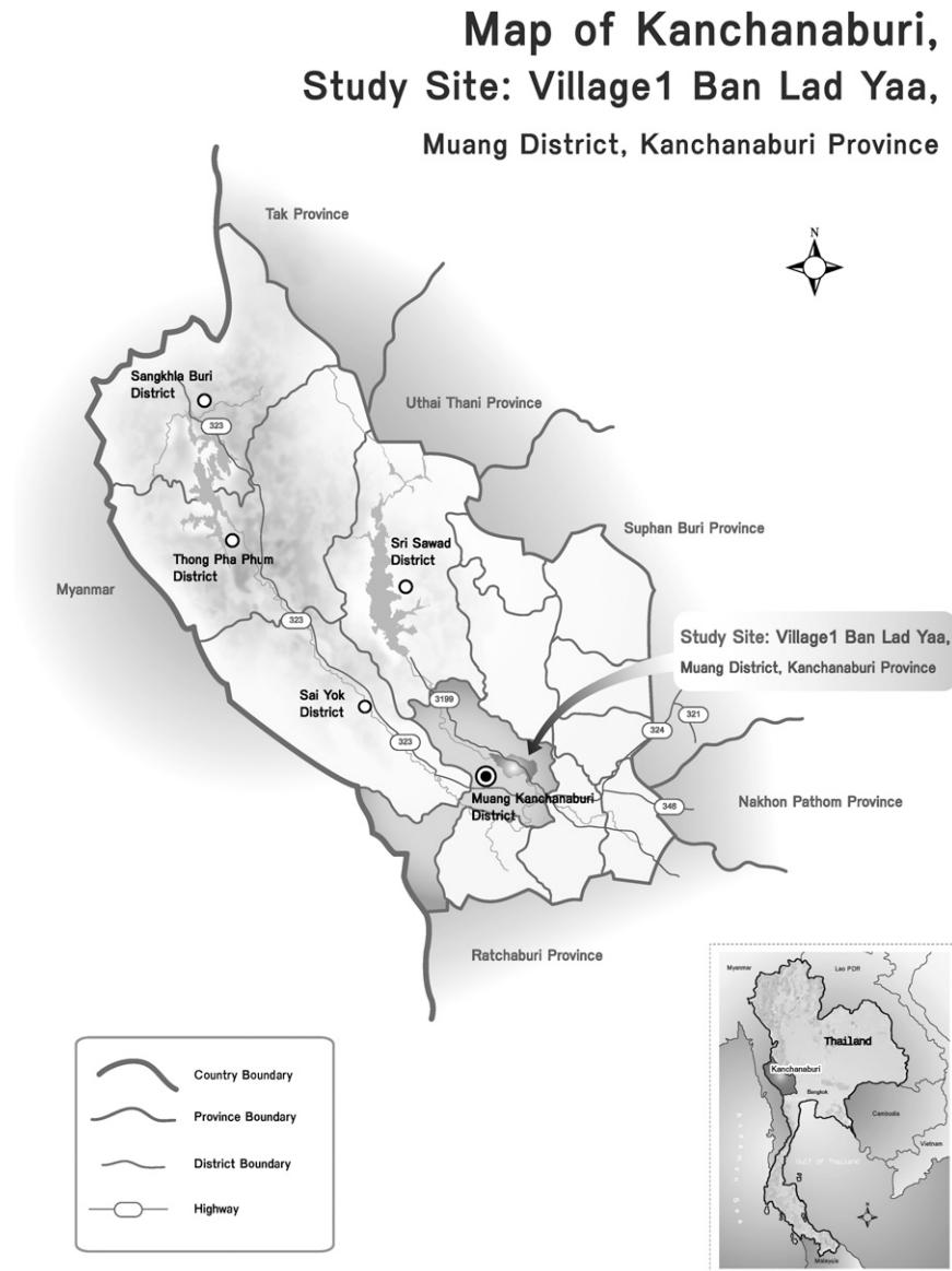
FIGURE 2. Kanchanaburi, Thailand study location from which inhabitants of Ban Lad Yaa within the Muang District were recruited for participation in focus group discussions.

Samples. In all, 102 individuals, between 25 and 65 years of age, participated in nine focus group discussions (5 groups in Peru and 4 groups in Thailand) (Table 2). The variation in total focus groups performed between the study sites reflects the use of saturation, defined as the point at which no new themes or information emerges during the data collection that was used to guide sampling in both sites. 25 Saturation is a commonly used threshold for sample size in qualitative research. 25