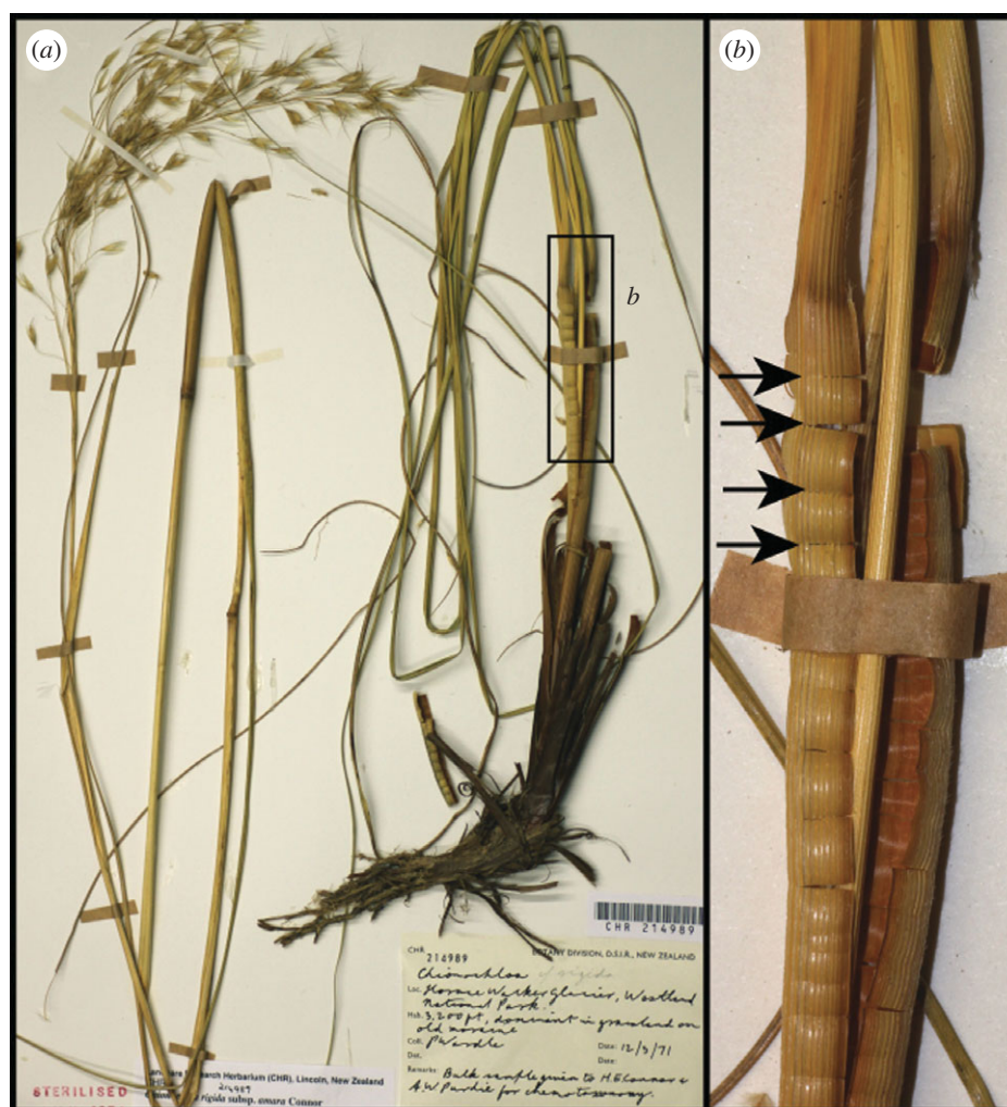
Figure 1. Leaf abscission in grasses. (a) Herbarium specimen of the New Zealand grass Chionochloa rigida , a leaf-abscising species. (b) Detail of fracture zone (inset in (a)) where old leaves are shed.