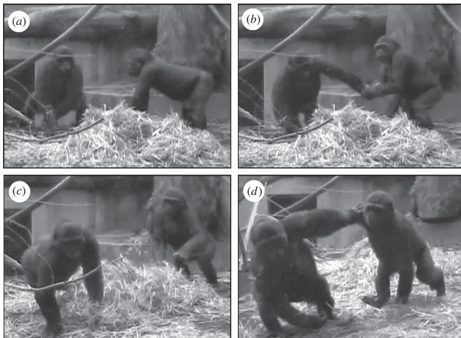
Figure 2. 'Hit-and-run' in gorillas. The individual on the left ( a,b ) hits the individual on the right and ( c,d ) then runs away. The individual on the right ( c,d ) responds by chasing. Seven of eight subjects displayed this behaviour (electronic supplementary material, video).

latter ones predominantly displayed open-mouth faces while running after their playmates and hit them more often at the end of the chase than vice versa. Such distinctive play roles might help individuals to acquire more refined communicative skills, integral for a wide range of social contexts [13]. The capacity to take the perspective of others might be enhanced by such role play [14,15], which forms an important prerequisite for empathy-related behaviours in humans [16]. Reversals of these distinctive chase roles in the gorillas of this study occurred consistently after hitting, similar to the game of tag in children [7,8].