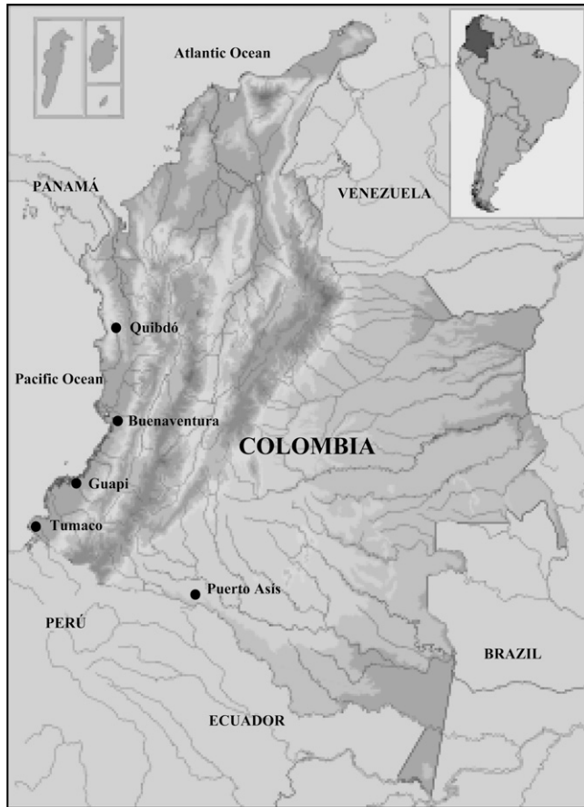
FIGURE 1. Map of Colombia depicting the geographical sites where the 24 parasite isolates were collected: Quibdó (Chocó) N = 5 ; Buenaventura (Valle del Cauca) N = 5 ; Guapi (Cauca) N = 5 ; Tumaco (Nariño) N = 5 ; and Puerto Asís (Putumayo) N = 4 .

cycles comprised an initial denaturation for 5 min at 94°C, then 30 cycles of 1 min at 94°C; followed by cycles of 1 min at 64°C and 1 min at 72°C; and a final 10 min extension step at 72°C. Amplified products ( \approx 1,238 bp) were visualized by electrophoresis on 1.2% agarose gels.