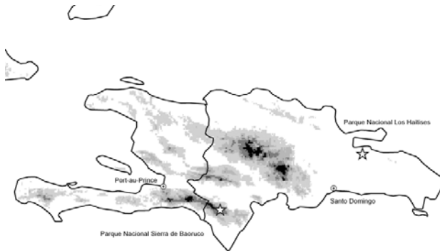
Figure. Hispaniola in the West Indies, on which are located Haiti (western third of the island) and the Dominican Republic. West Nile virus transmission occurred at Parque Nacional Los Haitises before November 2002. Shades of gray are 500-m intervals (e.g., 0–500, 500–1000).

Serum samples were screened for flavivirus-neutralizing antibodies by plaque-reduction neutralization test (PRNT) according to standard methods (11) and by using challenge inocula of 100 plaque-forming units (PFU) WNV strain NY99-4132 and Saint Louis encephalitis virus (SLEV) strain TBH-28. Testing for neutralizing antibody