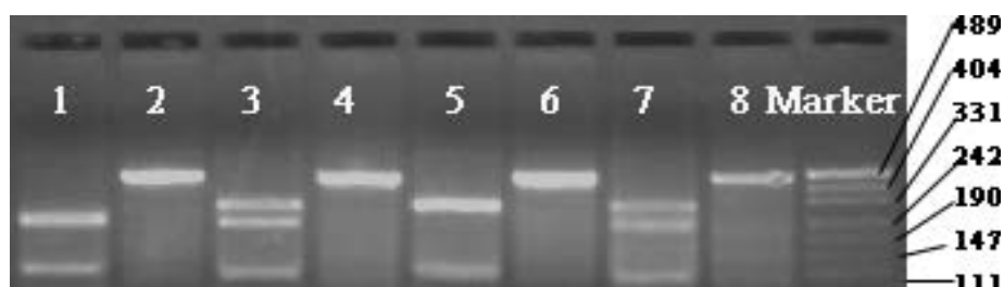
Figure 1 Representative agarose gel electrophoresis illustrating PCR products for the IL-10 promoter polymorphisms (-592 polymorphism): lane 2, 4, 6 and 8, 456 bp marker; lane 1, homozygous AA subject; lane 3 and 7, heterozygous subject; lane 5, homozygous CC subject, C allele does not cut with Rsa 1; A allele cuts with Rsa 1 to generate 240- and 115-bp fragments.

In HCV infection, the influence of IL-10 genotypes either on different clinical features of liver disease or in the response to antiviral therapy has been evaluated in several studies: data are highly controversial with some studies showing a positive association and others denying such a link [18,22,23]. Taken together, the some investigation has shown that responsiveness to IFN- \alpha treatment in patients with chronic hepatitis C is closely