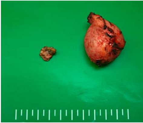
Fig. 2. The macroscopic findings displayed an oval-shaped, gray-white appearance and the cysts was filled with a thick yellowish material.