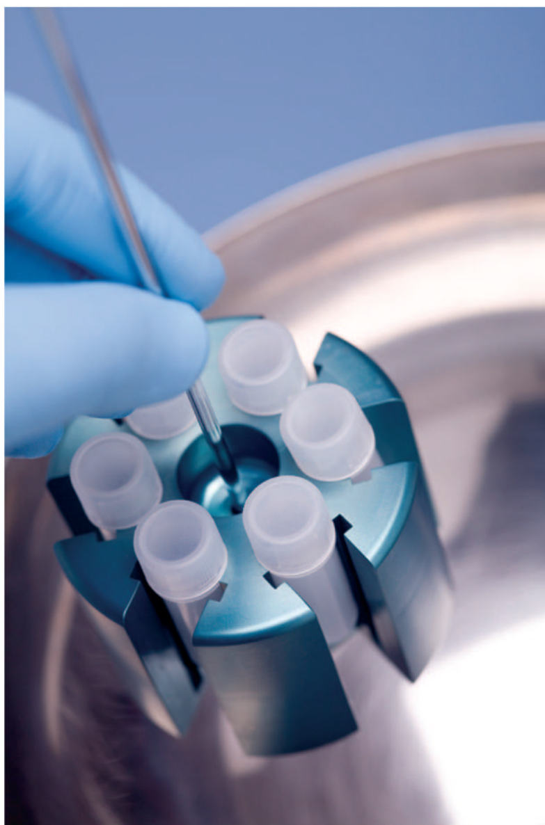
Fig. 1. Frozen resources A researcher retrieves medical samples.