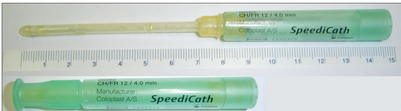
Fig. 1. The SpeediCath Compact catheter as it looks when opened and ready-to-use (upper) and before opening (lower).

All patients received a questionnaire and the child or the parent had to answer it. The nurse explained the questions. The questionnaire was translated to French and adapted from a previously reported study by Taskinen and colleagues. 5 It had 10 questions about package opening, ease of insertion and withdrawal, comfort, adaptation, CIC regularity, preparation and CIC time (approximation by patient) and the need for other materials to perform the CIC. They had to compare the HC to their usual catheter and to rate their satisfaction. Finally, respondents were asked to comment on