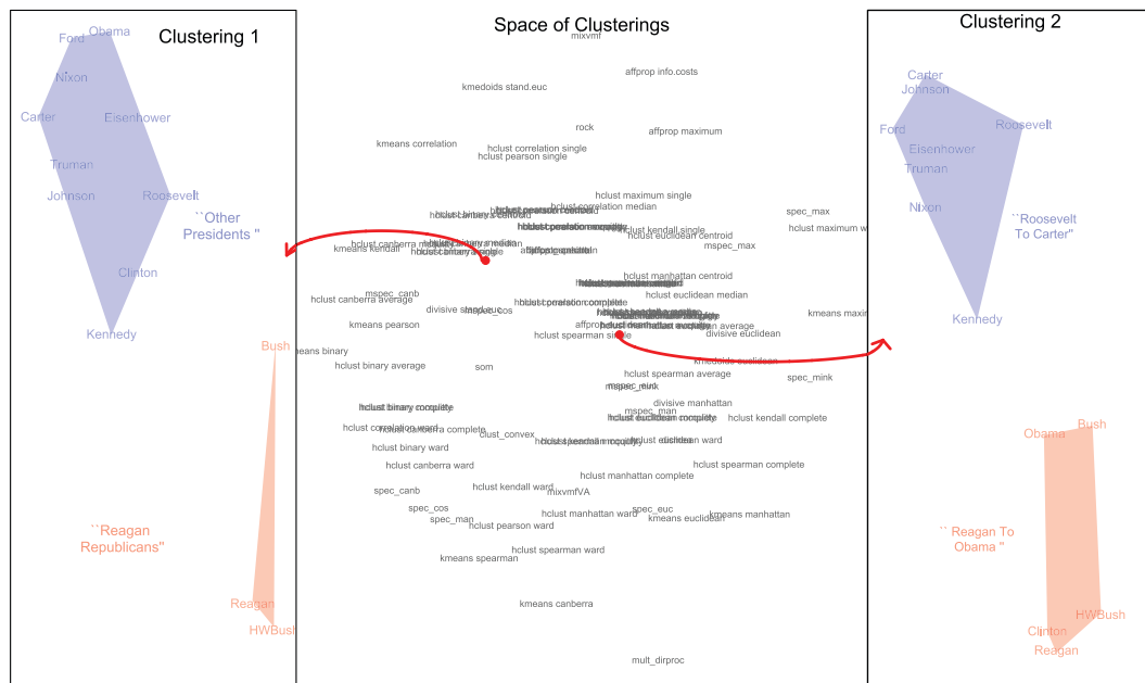
Fig. 1. A clustering visualization. The center panel gives the space of clusterings, with each name printed representing a clustering generated by that method, and all other points in the space defined by our local cluster ensemble approach that averages nearby clusterings. Two specific clusterings (see red dots with connected arrows), each corresponding to one point in the central space, appear to the left and right; labels in the different colored clusters are added by hand for clarification, as is the spacing in each.

The two-dimensional projection of the space of clusterings is illustrated in the figure’s middle panel, with individual methods