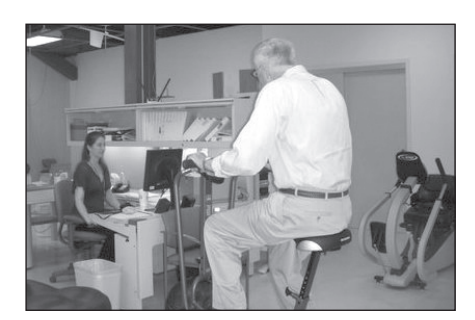
Figure 2. A study participant, supervised by a staff member, is exercising on an airdyne bicycle, which allows participants to get both an upper- and lower-body workout.

I am an 80-yearold widower who had been degenerating physically from simple lack of ambition and motivation. This opportunity to learn proper exercise and enjoy some social life with fellow participants has been enjoyable.