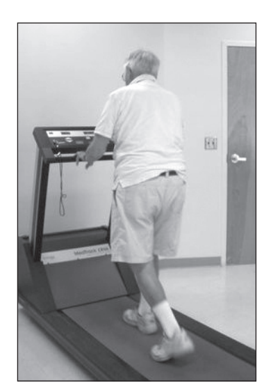
Figure 3. A study participant exercises on a treadmill at the lab in the Veterans Affairs Palo Alto Hospital.

tion and additional AAA resource materials for health care providers are available on our Web site (http://aaastop.stanford.edu) or through the Vascular SCCOR offices in the Division of Vascular Surgery at Stanford University: Call 650-498-6039 or e-mail juliejohnsonwhite@stanford. edu. Patients who are interested in study participation are encouraged to visit our study Web site.