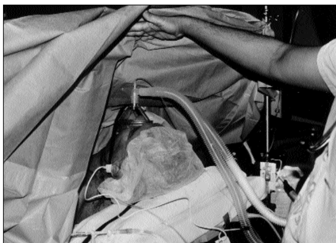
Figure 3. The patient is in the supine position, and the procedure performed with the patient under local anesthesia without intubation.

Next, the 30° side arm operating telescope was introduced through the same port after the trocar was removed. Almost complete visualization of parietal and visceral pleura is possible after gentle retraction of the lung. Blunt and sharp dissection can be easily performed through the same port with a blunt probe, forceps, or