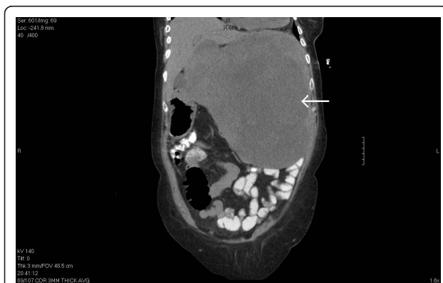
Figure 1 A computed tomographic scan of a large splenic mass (coronal view). See attached arrow.

were relieved and her diet was advanced slowly. Her pathology demonstrated a carcinosarcoma with malignant stromal and epithelial components consistent with ovarian origin heterologous cartilage (original magnification, × 20; hematoxylin and eosin stain) (Figure 3).