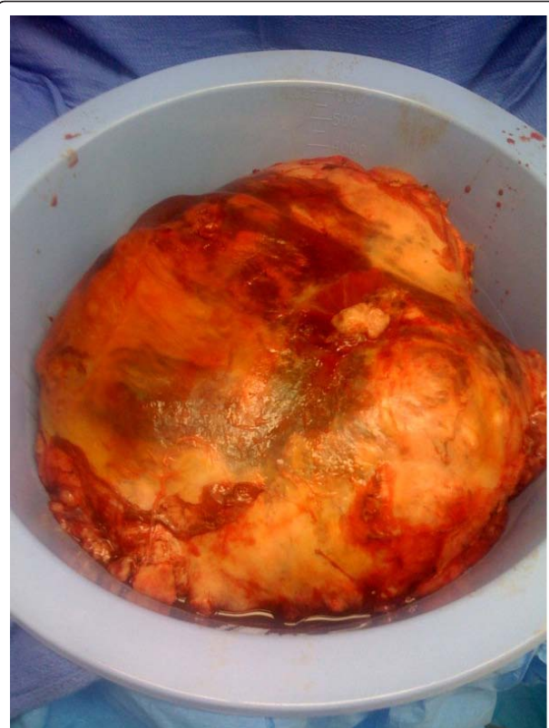
Figure 2 Gross specimen measuring 30 cm × 27 cm × 20 cm (4.2 kg).

In addition to the planned splenectomy, a partial gastrectomy was performed because the splenic tumor directly invaded the proximal stomach. The splenic mass was delivered en bloc and without evidence of rupture. The specimen weighed 4.2 kg and had a grossly intact capsule beside the region in which it had invaded the stomach (Figure 2). The gross specimen measured 30 cm × 27 cm × 20 cm. Estimated blood loss was 2200 mL secondary to bleeding. A total of eight units of packed red blood cells, four units of fresh frozen plasma and two units of platelets were administered during the procedure. Post-operatively, the patient did well. She was extubated on post-operative day four. An upper gastrointestinal gastrograffin study showed no overt extraluminal contrast. The patient's symptoms of early satiety