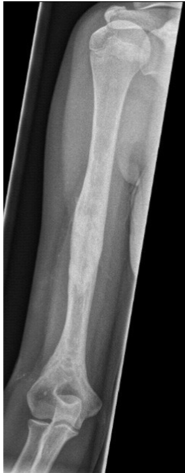
Figure 5 Complete Consolidation after a long history of failed treatment. Results 13 months after ESIN and treatment with Orthoss ® and GPS ® . Clinically the patient achieved an excellent functional result without refracture or deviation of axis.