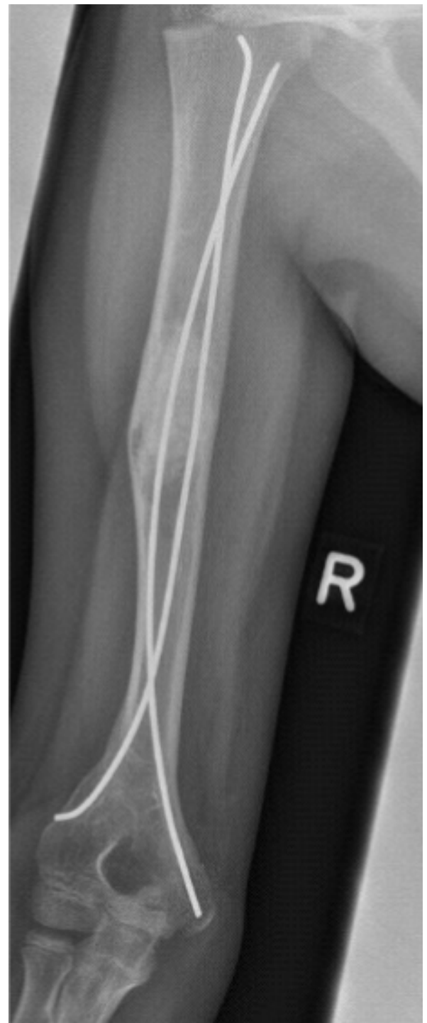
Figure 3 Failed Consolidation after treatment with nailing alone. Elastic stable intramedullary Nailing in combination with Orthoss® and GPS® after earlier failed treatment. Radiograph three months following the initial GPS®/Orthoss® treatment resulting in bone mineralization.

Other treatment strategies such as filling the cysts with cortisone [3,5,6], bone marrow [7-9,33,34] or allogenic bone grafts were evaluated [10-12,35]. Long-term studies of percutaneous injection of methylprednisolone acetate have not supported the initial satisfactory results with success rates of only about 50 to 60% [36]. Failure rates of about 80% for cortisone, 64% for curettage and 50% of combined procedures with bone marrow have been reported [16]. In a case series Lokiec reported the consolidation of bone cysts in all ten patients treated with percutaneous autologous marrow grafting allied to multiple perforations of the cysts before injection [33], which - in our opinion - will additionally weaken the affected bone. All these described methods may produce