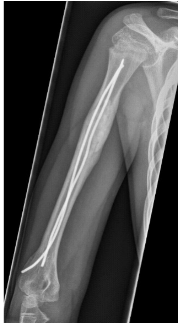
Figure 7 Patient presenting with acute pathologic fracture. Consolidation with ESIN, Orthoss® and GPS®. Lateral view X-ray five months after treatment with ESIN, Orthoss® and GPS®. As a consequence, Nails could be removed.

consolidation of the cyst but they do not initially enhance the mechanical stability of the weakened bone [37]. As a consequence patients have to avoid strenuous activities and sports for the duration of the healing process, which might be years [6,16]. In our experience, this is not seen as a valid therapeutic option by parents and patients.