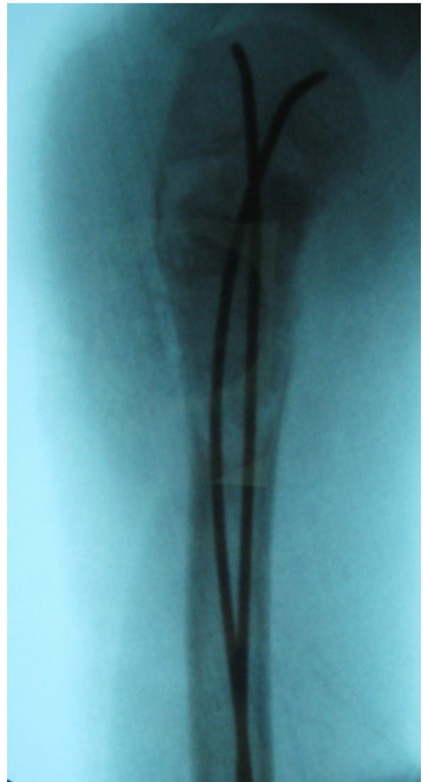
Figure 11 Incomplete filling of the cyst. Intraoperative fluoroscopic control after Orthoss® and GPS® application. Small filling defect in the upper part of the former cyst visible.

The combined biological and mechanical treatment of simple bone cysts was described for the first time by Kanellopoulos. His treatment employed demineralized bone matrix and autologous bone marrow injection in addition to intramedullary nailing for the stabilization of bone cysts. In seven patients the cysts consolidated completely; two consolidated partially [13,38]. Although autologous bone marrow collection is considered a relatively simple procedure, it can be associated with numerous complications such as biopsy site bleeding, hematoma or infection [39,40]. Harvesting enough bone marrow for huge cysts in children is sometimes problematic and causes more pain than filling the cyst and implanting the nails. To avoid these complications, we added GPS® and Orthoss® to our treatment, the rationale being that the application of growth factors from