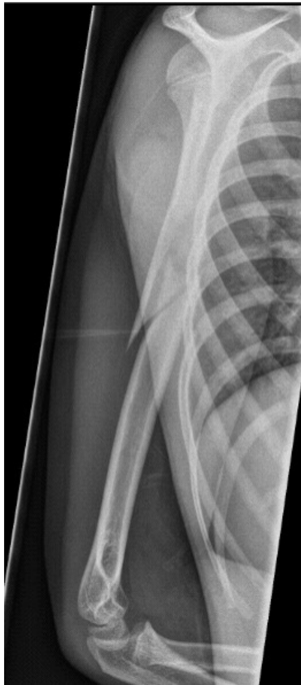
Figure 6 Patient presenting with acute pathologic fracture. Consolidation with ESIN, Orthoss® and GPS®. Pathologic fracture of the right humerus after a fall on wet grass.

consolidation of the cyst but they do not initially enhance the mechanical stability of the weakened bone [37]. As a consequence patients have to avoid strenuous activities and sports for the duration of the healing process, which might be years [6,16]. In our experience, this is not seen as a valid therapeutic option by parents and patients.