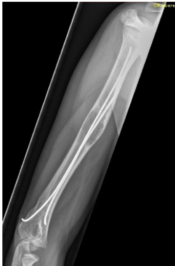
Figure 2 Failed Consolidation after treatment with nailing alone. Persistence of cyst after earlier failed treatment (Elastic stable intramedullary Nailing 4 years previously).

NEER supported prompt surgical intervention with curettage and bone grafting as “the best way to rehabilitate these young children” producing successful healing in 55% to 65% of cases [32].