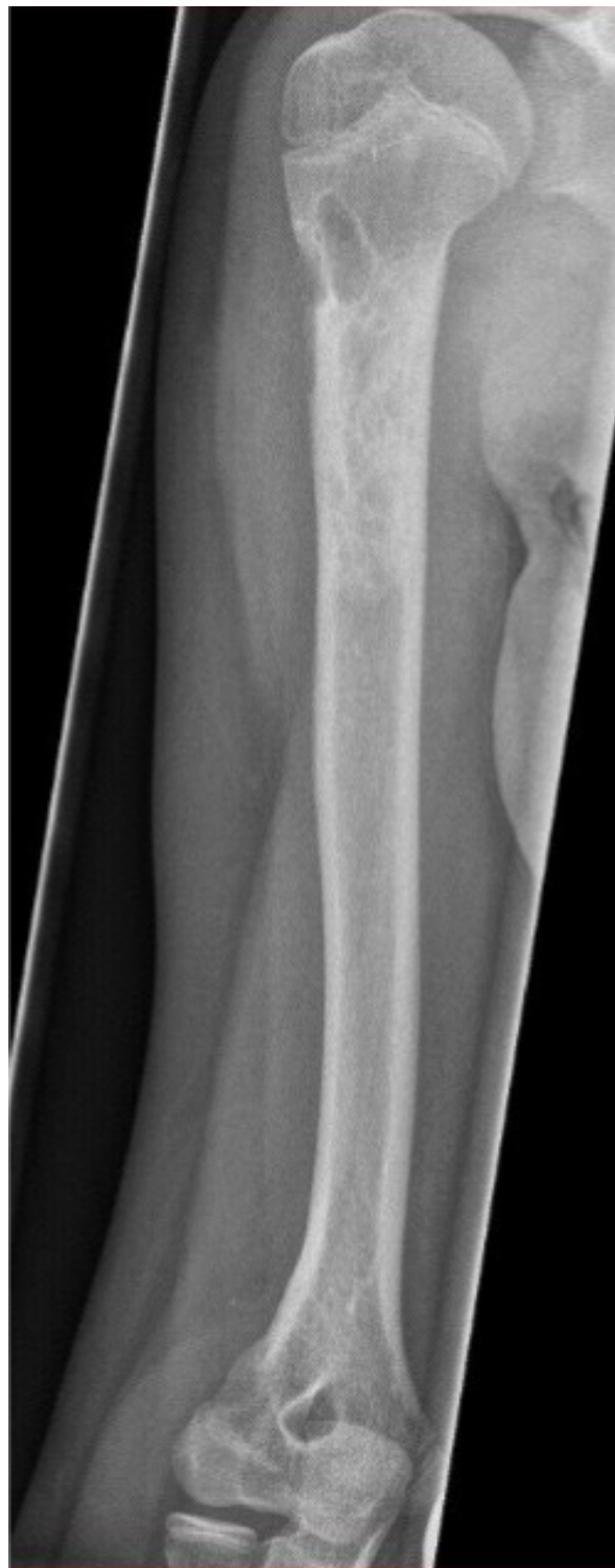
Figure 12 Incomplete filling of the cyst. 23 months after nail removal. Small residual cyst in the area of the former postoperative defect (Capanna Typ 2).

with their appearance. No patient showed any changes in their intra- or postoperative vital parameters. The most significant benefits of using the GPS ® -System are its autologous nature, the fact that it is endogenously derived and its easy availability. There are no issues of immunogenicity or transmission of infection by using the GPS ® -System or the artificial bone substitute Orthoss ® . Hass reported the successful use of demineralized human bone matrix (Grafton ® ) for the treatment of bone cysts in seven children. The disadvantages of this approach are the high costs and the, albeit low, risk of infection [42].