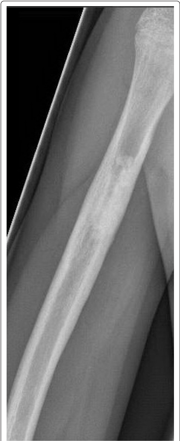
Figure 9 Patient presenting with acute pathologic fracture. Consolidation with ESIN, Orthoss® and GPS®. 12 months after nail removal. Capanna Typ 1.