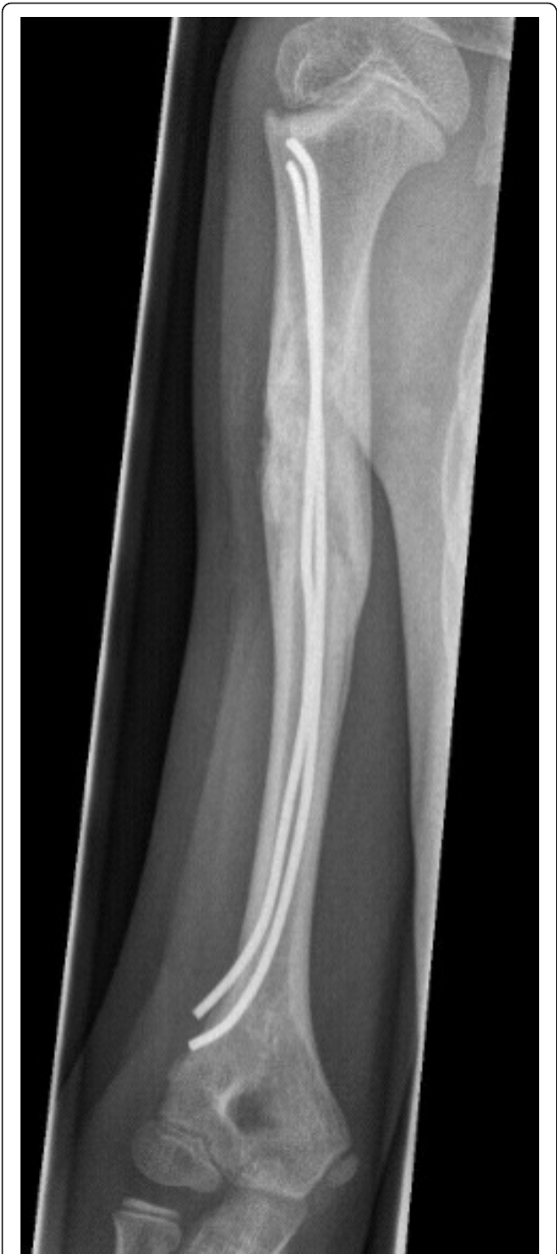
Figure 8 Patient presenting with acute pathologic fracture. Consolidation with ESIN, Orthoss® and GPS®. Anterior-posterior X-ray five months after treatment with ESIN, Orthoss® and GPS®. As a consequence, Nails could be removed.