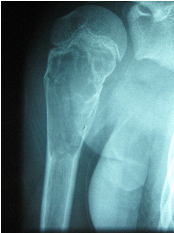
Figure 10 Incomplete filling of the cyst. Acute pathologic fracture of the right proximal humerus.

postoperative immobilization render this method unconvincing [13,38]. In our study earlier treatment with ESIN on its own had failed in four patients, which was also the case in another cyst that was additionally treated with a product containing tricalciumphosphate (Cerasorb®). The duration of their treatment history was four years and two of the children underwent multiple operations.