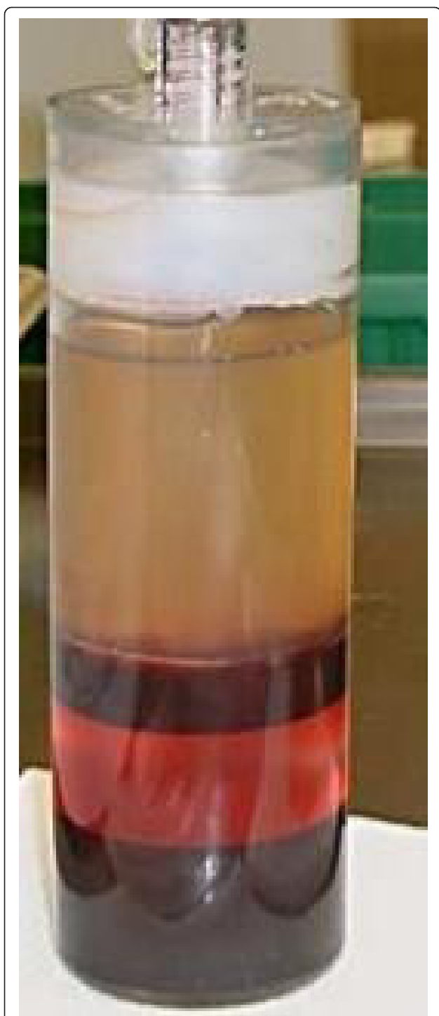
Figure 1 GPS ® -Tube after centrifugation. The GPS ® tube after centrifugation: The red blood cells fraction at the bottom of the tube is separated from the buffy coat by a buoy. The platelet-rich plasma is above and is separated from the platelet-poor plasma after the white plunger is manually pushed down.