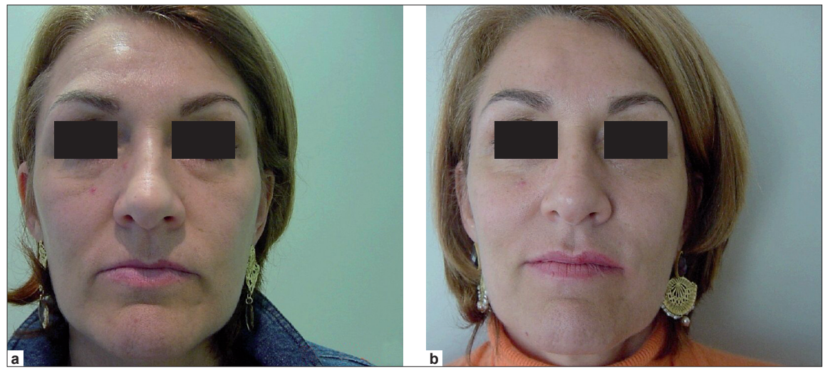
Figure 4: (a) Patient with hypotrophy of the upper vermillion border, marked grooves and downturn of the corner of the mouth. (b) Improvement after injection of BoNT/A into the platysma and depressor anguli oris muscles and a plasmagel filling of the grooves and vermillion border