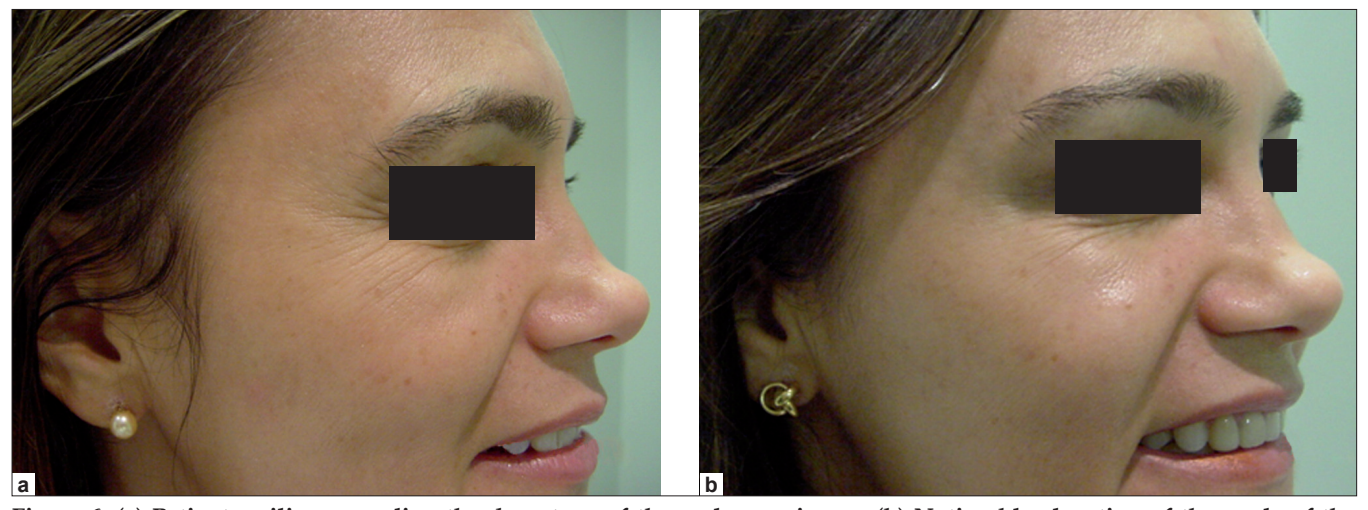
Figure 6: (a) Patient smiling, revealing the downturn of the oral commissure. (b) Noticeable elevation of the angle of the mouth and improvement of the smile after application of BoNT/A in the depressor muscles