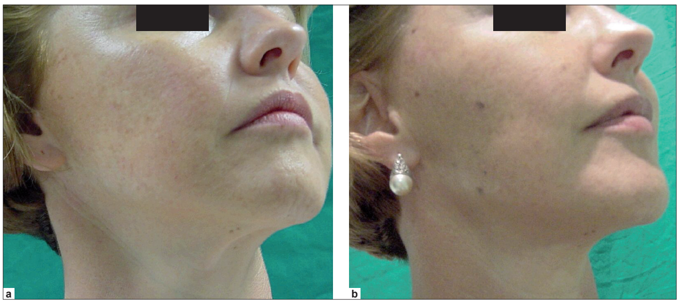
Figure 1: (a) Patient with marked bands of the platysma muscle and ptosis of the oral commissure. (b) After BoNT/A treatment, the attenuation of the bands and the elevation and new orientation of the oral commissure can be observed