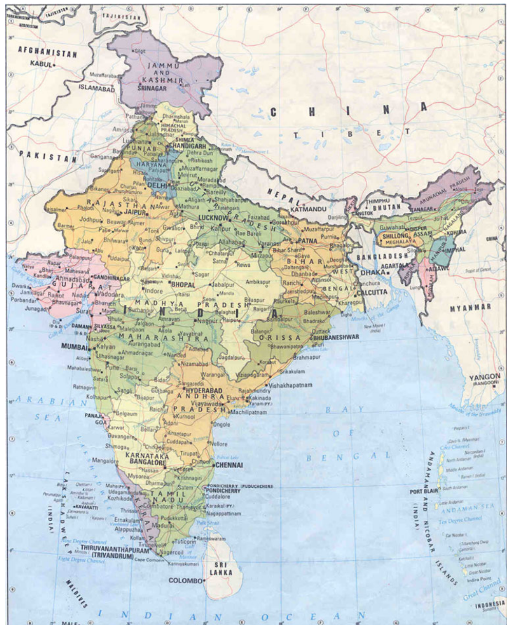
Fig. 1 Political map of India

far below the required number. The lack of organized pre-hospital care coupled with the lack of resources and the high volume of patients that through the government-run tertiary care hospitals further compound problems [7].