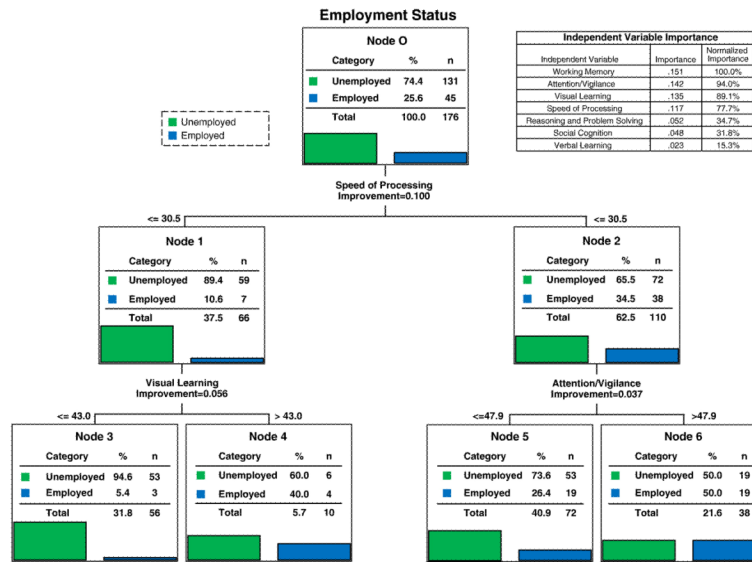
Figure 3. Results from CART Analyses for Discrimination of Schizophrenia Individuals according to Employment Status.