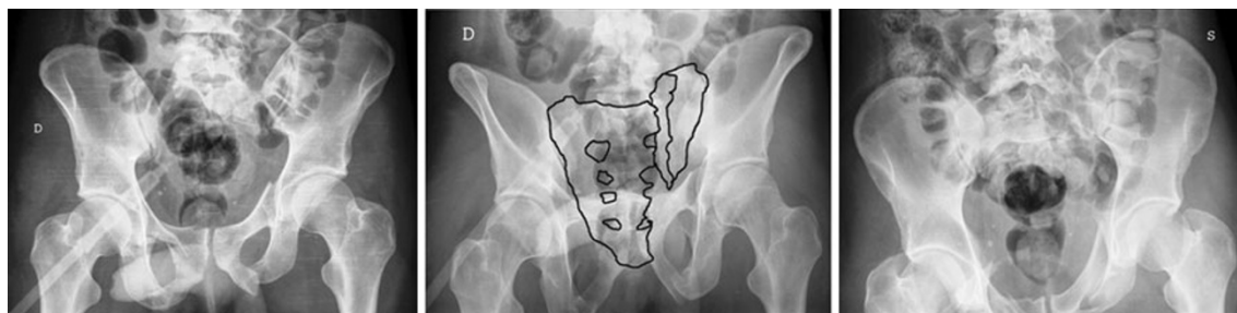
Fig. 1 Illustrative case: pre-operative radiograms (antero-posterior, outlet, inlet) showing a multi-planar displacement with maximum value of 21 mm