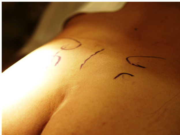
Fig. 3 Bony landmarks drawn on the skin. The PSIS and the sciatic notch are individuated bilaterally by palpation. In the middle , the sacral spinous line

achieve placement in the direction of the iliac wing (Fig. 5a).