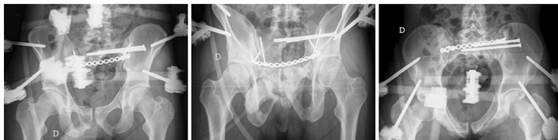
Fig. 2 Illustrative case: post-operative radiograms. Fixation is achieved by two ilio-sacral screws, a posterior tension-band plate and anterior external fixation. Maximum residual displacement was 6 mm