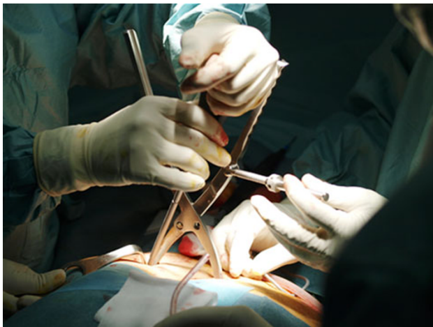
Fig. 6 When the reduction seems satisfactory, the Jungbluth clamp is tightened and the result is checked on the three standard fluoroscopy views

screw may be used if the area of safe placement is limited [14]. At the end, screw position has to be confirmed on antero-posterior, inlet and outlet views [15–19]. In very unstable disruptions, and whenever possible and safe, use of a trans-sacral screw is suggested, as this type of fixation seems to provide greater stability [20].