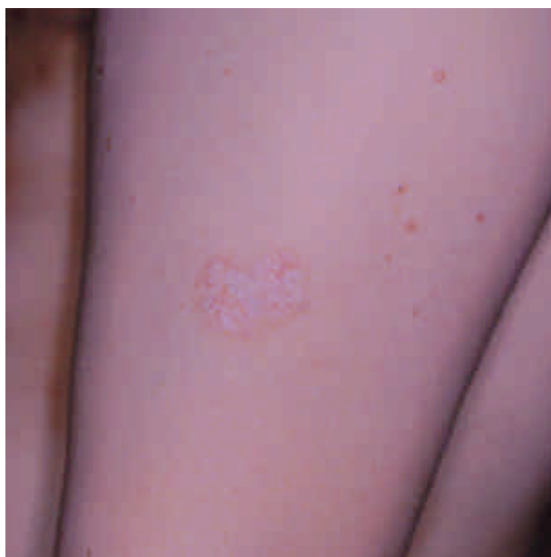
Fig. 1. Maculopopular eruption on deltoid area at day 19. Patient with breast cancer received GM-CSF therapy (400 \mu\text{g}/\text{day} , sc) for chemotherapy-induced neutropenia and developed skin lesion at the injection site of recombinant GM-CSF.