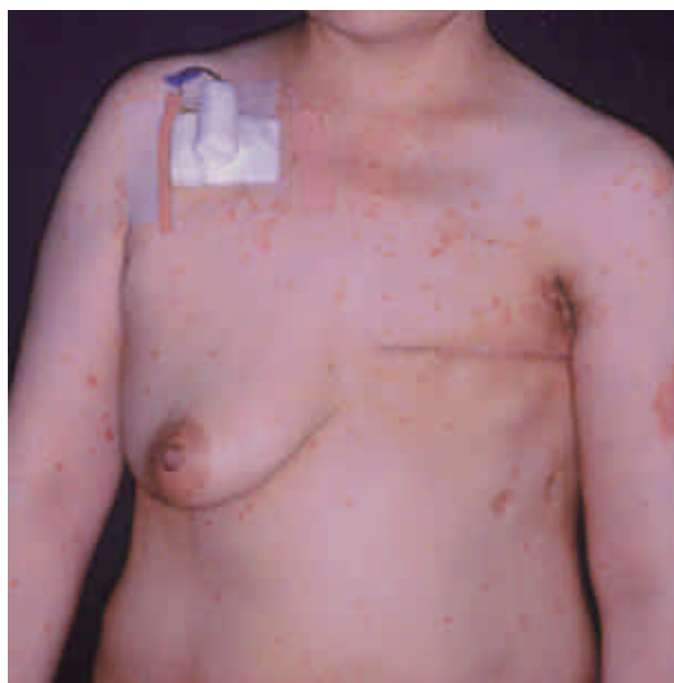
Fig. 3. Severe systemic flare of psoriasiform eruption appeared after changing GM-CSF into G-CSF at day 38.

eruption on the GM-CSF injection site during leukocyte recovery (Fig. 1). The skin biopsy specimen showed marked hyperkeratosis, parakeratosis and Munro's abscess in the cornual layer. In addition, elongation of rete ridges, with thickening in their lower portion, was also noted