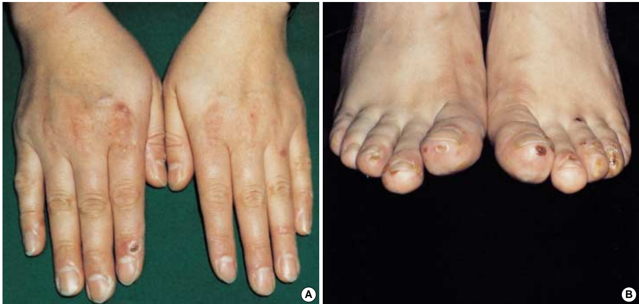
Fig. 1. Multiple discrete vesiculopustules with crusts are seen on the tips of the fingers (A) and toes (B).