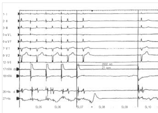
Fig. 2. Sinus node recovery time during electrophysiologic study (paper speed: 50 mm/sec). hRA: high right atrium; His: His bundle.

Bognolo et al. (5) reported a 50-yr old patient with SSS, sug-