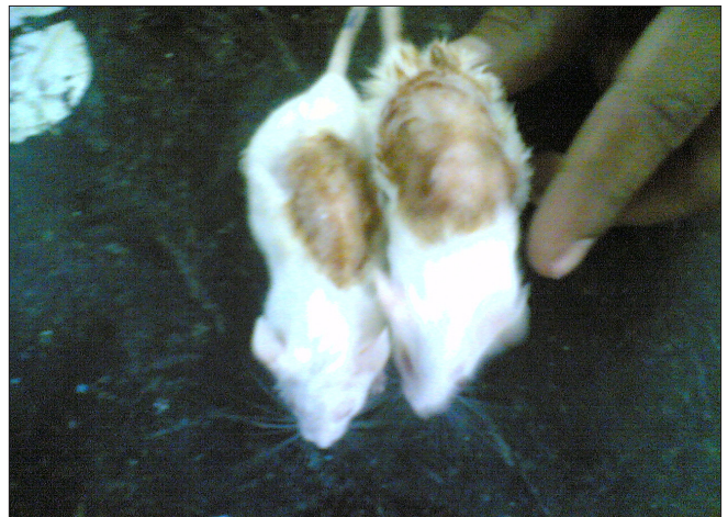
Figure 6: Rats treated with 10% extract

acid, cooling, constipating, anthelmintic and depurative. It is useful in bronchitis, hyperacidity, vitiated conditions of pitta , dysentery, verminosis, diabetes, leprosy and skin diseases. [6]