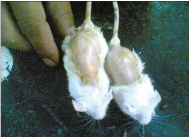
Figure 3: Rats treated with 5% extract + 2% minoxidil