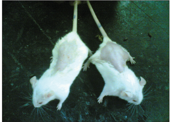
Figure 4: Rat treated with 2% minoxidil