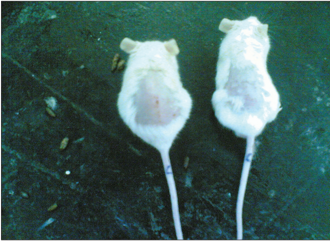
Figure 1: Rats of control group