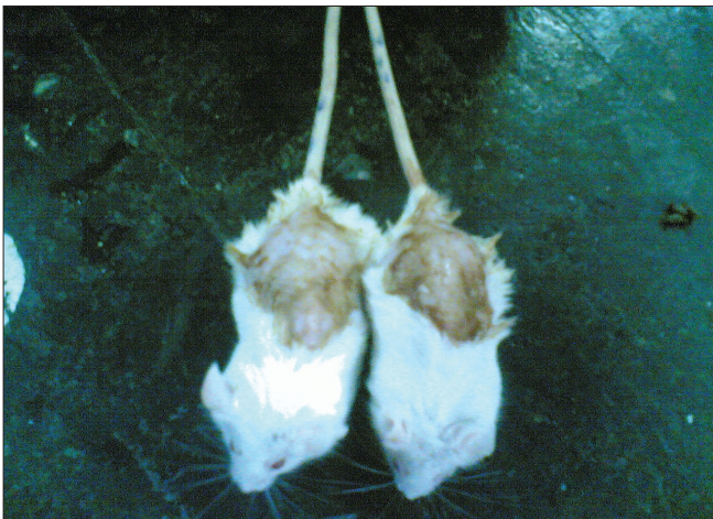
Figure 5: Rats treated with 10% extract + 2% minoxidil