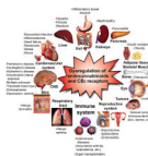
Fig. 1. Role endocannabinoid-CB 2 signaling in various diseases affecting humans. Selected disease conditions are shown in which dysregulation of the endocannabinoid-CB 2 signaling is implicated in the pathology. Conversely, in these conditions pharmacological modulation of CB 2 receptors may represent a novel therapeutically exploitable strategy.