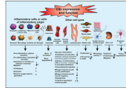
Fig. 2. Cannabinoid 2 receptor (CB 2 ) expression and its known cellular functions. CB 2 receptors are most abundantly expressed in cells of the immune system and in cells of immune origin. In these cells CB 2 receptors mostly mediate immunosuppressive effects. CB 2 receptor expression was also reported in activated/diseased various other cell types. Importantly, in various pathological conditions CB 2 receptors were reported to be markedly upregulated in most of the shown cell types, and were attributed to play important role in various indicated cellular functions. Some of these effects are context dependent and may largely be determined by the type of the injury/inflammation and its stage.