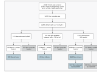
Figure 1. Number of Patients with Cardiac Arrest in Subgroups and According to the Location Where the Arrest Occurred AED denotes automatic external defibrillator, and EMS emergency medical services.