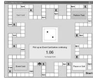
Figure 1. Computer screen display of the computerized Virtual Week game.