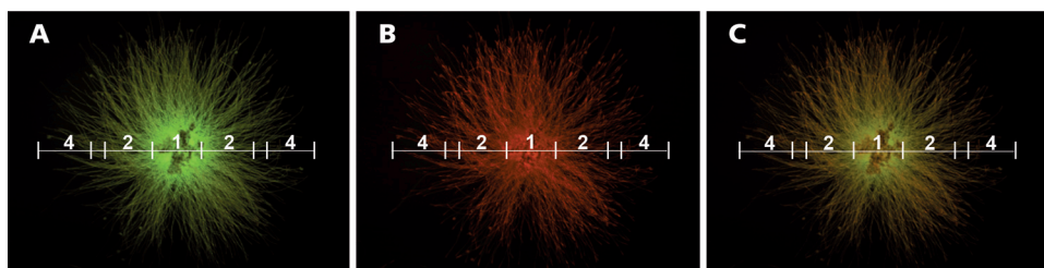
FIG. 3. Heterogeneous distribution of RNA in microcolonies of a liquid shaken culture of A. niger . (A and B) Acridine orange staining shows that double-stranded DNA is present mainly in the center of a microcolony (A), whereas single-stranded mRNA is observed predominantly at the periphery (B). (C) Overlay of A and B. Zones within the colony are indicated by vertical lines.

and of RNAs of the actin gene, glaA , and faeA between the zones. However, the RNA from the central zone 2 originated from 45-times-more hyphae than did the RNA from the peripheral zone 4. Acridine orange staining confirmed that the hyphae in zone 2 contained less RNA, while staining with propidium iodide showed that \geq 99\% of the hyphae were alive (our unpublished results). The huge difference in RNA abundances between the periphery and the center was not observed for macrocolonies grown on a solid medium (our unpublished results). We have no explanation for this finding. The size and open structure of the microcolonies suggest that the center was not affected in the uptake of nutrients and transfer of gases.