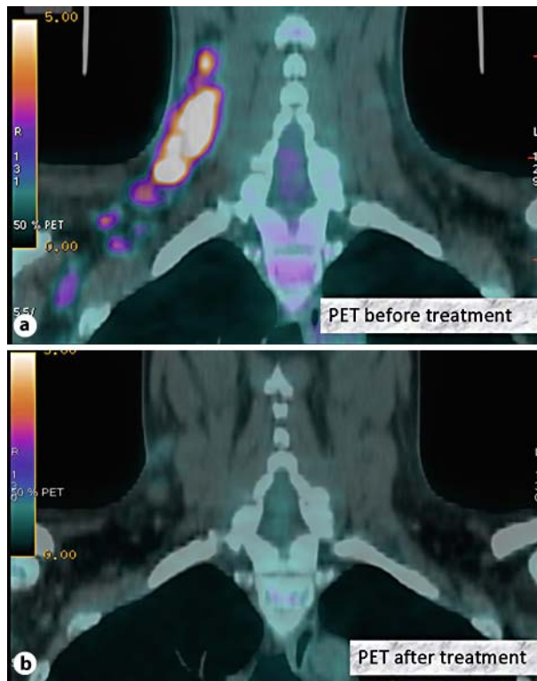
Fig. 2. a PET-CT with pathologically increased glucose metabolism in enlarged cervical lymph nodes. b PET-CT with metabolic remission after 2 cycles of ABVD chemotherapy (adriamycin, bleomycin, vinblastine and dacarbazine).