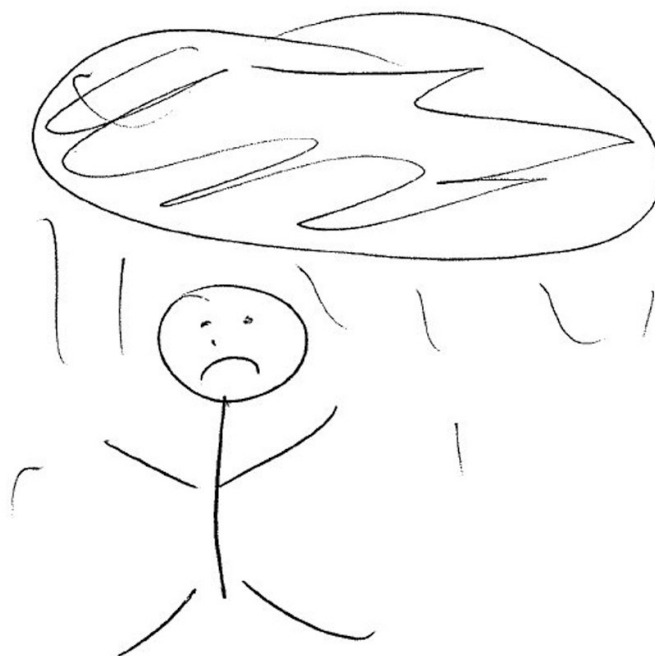
FIGURE 1. A 24-year-old White woman's drawing. She explained she sees persons who decline HIV testing as “scared” and “in the dark.” (EQ07)