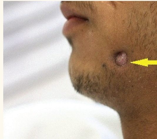
Figure 2: Photograph of patient 2. Arrow indicates odontogenic cutaneous fistula and retracted skin.

was initially diagnosed as a superficial skin infection and was treated for several months with a number of systemic and topical antibiotics which provided only temporary relief. Physical examination revealed a small retracted skin lesion on lower part of right cheek of about 5 mm in diameter. The skin opening of the lesion was crusted, but with minimal swelling. Gentle pressure on the surrounding tissue elicited a scanty non-purulent bloody discharge on the surface. There was also a cord-like palpable tract extending from the cutaneous lesion to the oral cavity inside. Intra-oral examinations showed poor oral hygiene and dental caries in the right lower premolar and first permanent molar (teeth nos. 45 and 46). The patient was referred to an oral and maxillofacial surgeon. His orthopantomogram (OPG) demonstrated well defined radiolucency around the apex of teeth 45 and 46 [Figure 1].