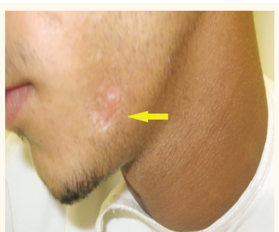
Figure 4: Postoperative photograph of patient 2. Arrow indicates scarring after surgery.

The classic lesion is an erythematous, smooth, symmetrical nodule, 1–20 mm in diameter with or without drainage. The chronic lesion often leads to retraction of skin secondary to scarring. A cord like tract can be felt attached to the underlying bony structure. Many of above mentioned typical findings were present in the two cases described in this report. Patients may experience intermittent remission of the symptoms. Intraoral examination may reveal dental caries or restorations and periodontal disease, but the examiner should keep in mind that even the tooth involved can appear normal. 7 The initial working diagnosis is