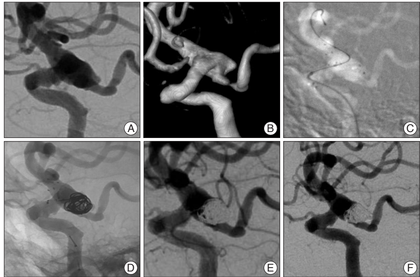
Fig. 3. Case 14; a 73-year-old woman with SAH. A : The left ICA angiogram shows the aneurysm before treatment. B : 3D reconstruction image shows wide-necked PCoA aneurysm (neck×height×width×length : 10.6×6.5×7.2×7.3 mm). C : Neuroform stent (4.5×15 mm) was deployed resulting in jailing two microcatheters. The microcatheters have different distal shapes; one has a 45° angled distal tip and the other has a 90° angled distal tip. D : Two coils (360° Guglielmi detachable coil 6×11 mm, Microplex coil Complex 5×15 mm) being deployed via two microcatheters. E : Immediately after treatment, a left ICA angiography shows residual contrast dye filling the neck to preserve the fetal type PCoA. The dome of the aneurysm is compactly occluded. But, there was a procedure-related thromboembolism at the left distal anterior cerebral artery. F : Two months after embolization, the angiogram showed no interval change and stable coils.

Despite advances in devices and techniques, some intracranial aneurysms remain difficult to treat with coils. Wide-necked