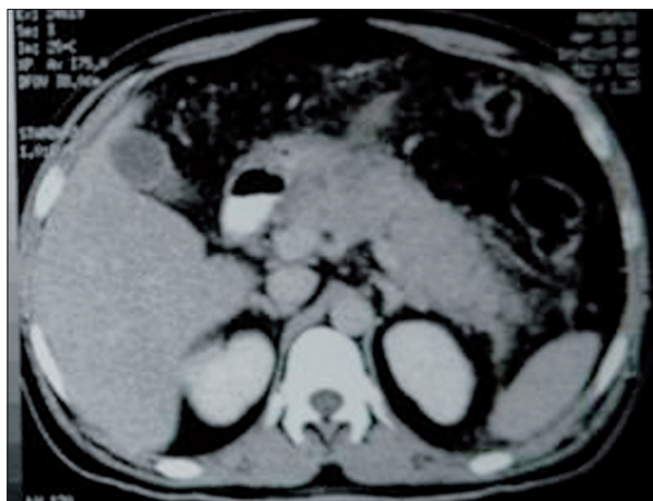
Figure 1: CT abdomen showing diffusely enlarged pancreas with irregular outline

or nephrolithiasis. Over the next 15 months, he suffered 3 more episodes of acute pancreatitis. During the second episode, CT abdomen revealed focal necrosis in the body (less than 30%).