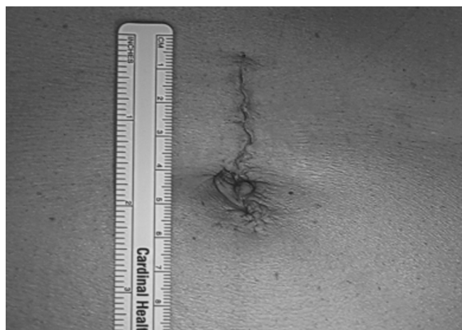
Figure 2. Surgical incision after completion of the procedure.

colon to facilitate exteriorization of the right colon and terminal ileum to facilitate extracorporeal mesenteric ligation and stapled colonic anastomosis. This technique facilitated a safe oncologic practice, with the removal of 14 lymph nodes and a 16-cm length of colon.