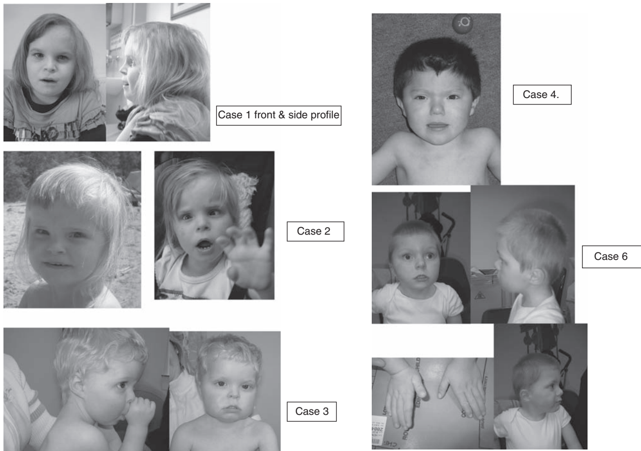
Figure 1 Clinical photographs of five affected individuals with 12q14 deletions. Informed consent was obtained for publication of photographs of cases 1–4 and 6.

previously suffered from constipation. On examination at the age of 7 years and 11 months, her Ht was 101.5 cm ( -4.21 SDS), Wt was 14.2 kg ( -4.42 SDS) and OFHC was 53.2 cm ( +1.13 SDS). Her mother and father are 161 cm and 176 cm tall, respectively. She has relative macrocephaly. Her height velocity has been 3–4 cm per year. Her leg length ( -2.4 SDS) is greater than her sitting height (4.9 SDS). She has a convergent squint, a high nasal bridge, long eyelashes and a cupid's bow. She has clinodactyly and her terminal phalanges are broad. She had fifth finger clinodactyly bilaterally. She has truncal obesity since the age of 10 years, with her weight velocity being greater than her height velocity.