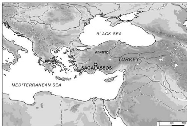
Figure 1 Geographic location of Sagalassos.