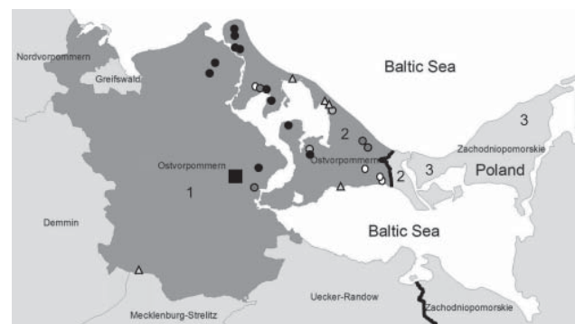
Figure 2. Region in Germany and Poland investigated for Trichinella spp. 1, Ostvorpommern, Germany; 2, Usedom Island, Germany; 3, Wolin Island, Poland. Triangles, Trichinella spp.–positive cases in raccoon dogs; circles, cases in wild boars; square, location of outbreak farm; white circles and triangles, cases in 2005; light gray circles, cases in 2006; dark gray circles, cases in 2007; black circles, cases in 2008.

The optimal habitat for raccoon dogs is wet areas and fields, small forests, and large ditches bordered by thick