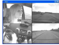
Figure 1a. Quad-image of Four Continuous Video Feeds.