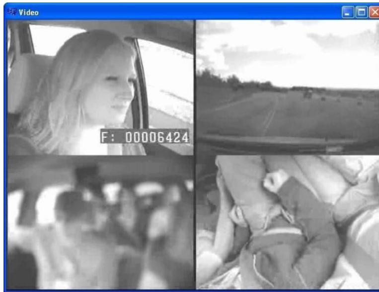
Figure 1b. Quad Image with Two Continuous Video Feeds (top) and Two Still Frames (bottom).