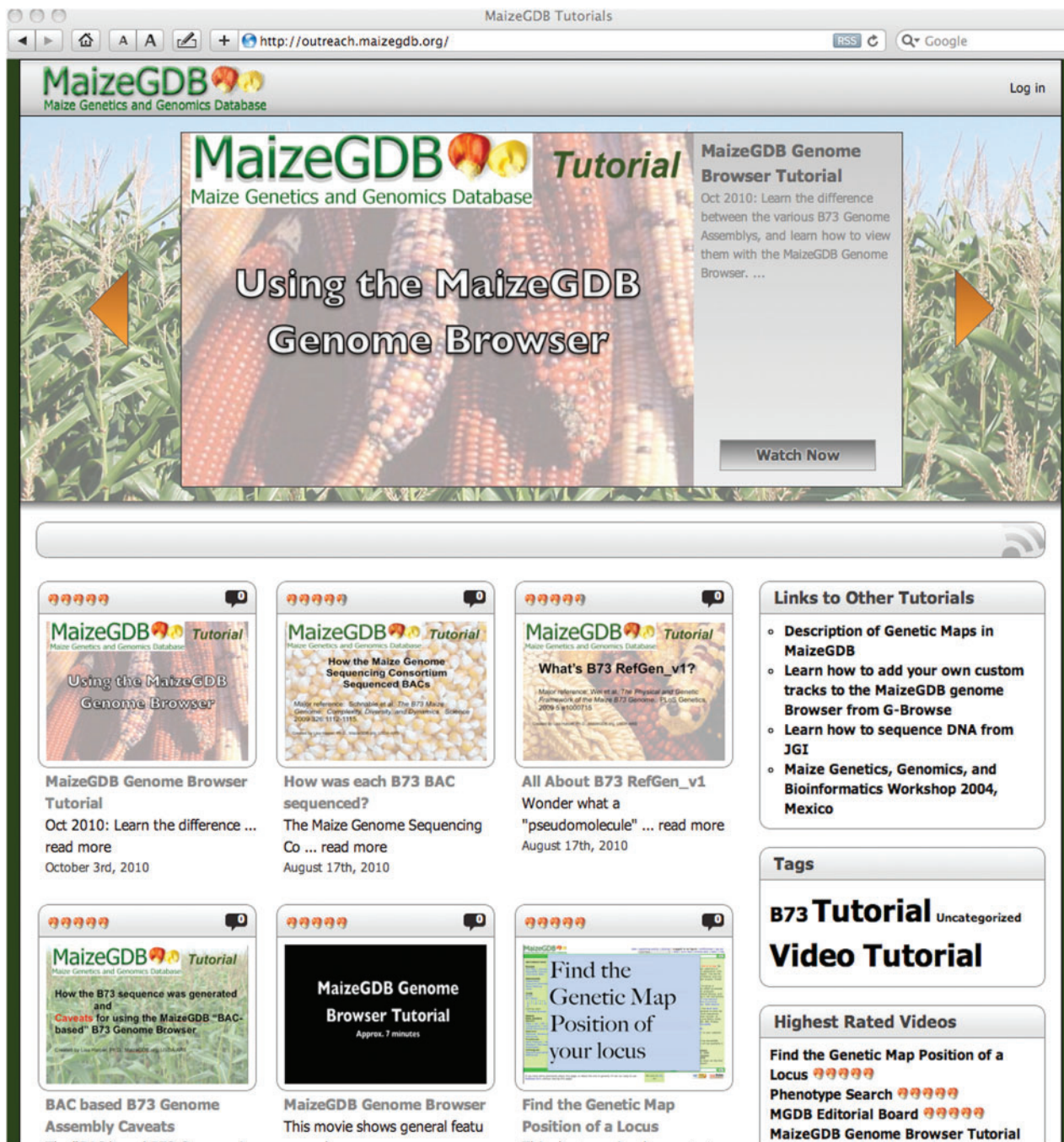
Figure 2. MaizeGDB's new tutorial page.