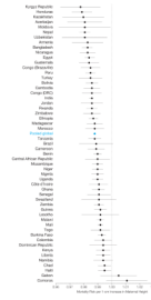
Figure 1. Country-Specific Adjusted Change in Offspring Mortality Risks for 1-cm Increase in Maternal Height Among Children Younger Than 5 Years Plotted on log scale; error bars are 95% confidence intervals (CIs). Wald test for equivalence of coefficients rejected ( \chi^2=165.37 , P<.001 ). See eTable 5 for relative risks and CIs by country. Tanzania refers to the United Republic of Tanzania and Guinea refers to the Republic of Guinea. An interactive information graphic is available at http://www.jama.com .