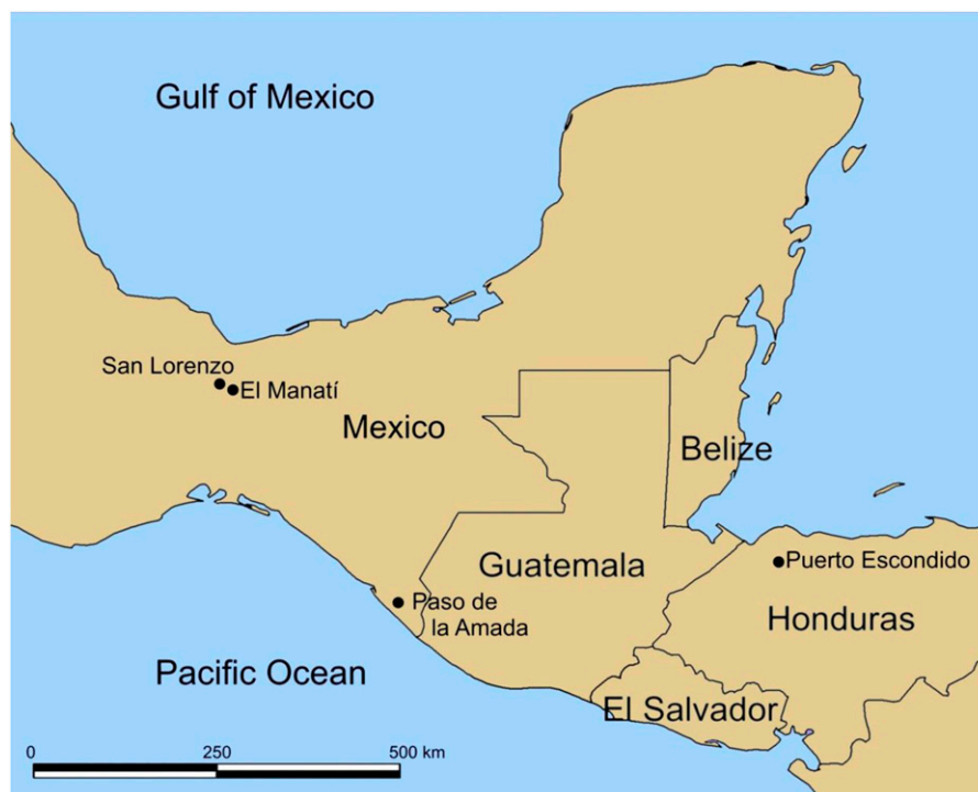
Fig. 1. Map showing the location of San Lorenzo and other early archaeological sites with evidence for cacao.

Liquid chromatography-tandem mass spectrometry (UPLC/MS-MS) analyses were performed on 156 samples to detect theobromine (Fig. 2). Briefly, 90 to 200 mg of each burr sample was extracted with 200 to 300 \mu L milli-Q water at 80 ^{\circ} C for 30 min. The extracts were filtered and the filtrates were used for UPLC/MS-MS analysis. Two additional unknown samples supplied to the University of California Davis laboratory by T.G.P. (modern pottery samples) were included in the analysis as controls. Detailed methods for sample preparation and UPLC/MS-MS analyses are in the SI Text .