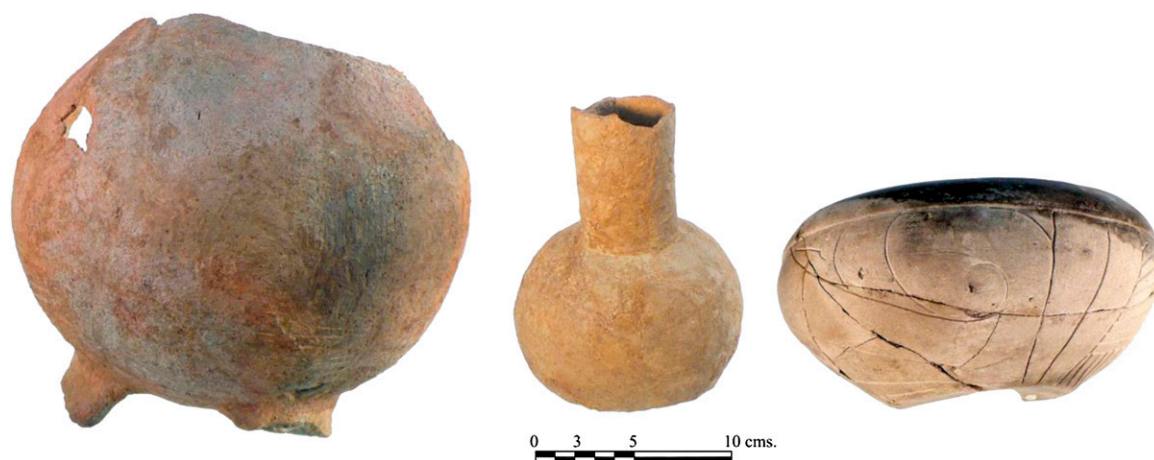
Fig. 4. Theobromine-positive vessels from the San Lorenzo B phase of the San Lorenzo site that illustrate storage, preparation, and serving functions. (Left to Right) Sample 110, a Caamaño coarse neckless jar with supports; sample 97, a Pochitoca polished bottle; and sample 108, a Tigrillo black-and-white incurved-rim bowl.

creasing diversification and specialization in the cacao process, which culminated in the consumption of cacao products, for the most part beverages. This phenomenon parallels regional and local trends of population growth and increasing social complexity (26). Whereas the lack of an apparent inclination toward cacao storage in pottery vessels may be because of the nature of the present sample, it also may be interpreted in other ways, including generalized cacao availability, storage in perishable containers, and the extended mobilization of this resource to nonproducing sections of the Olmec region and to distant peoples eager to participate in Olmec social networks.