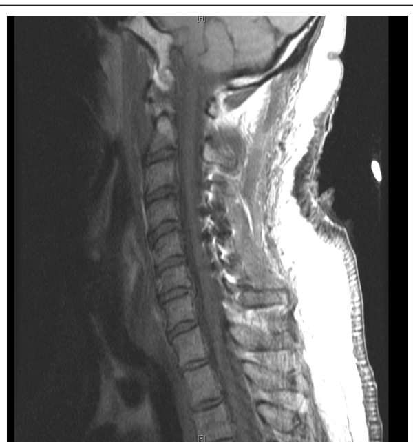
Figure 5 Normal post-operative sagittal T1-weighted MRI of patient's neck.