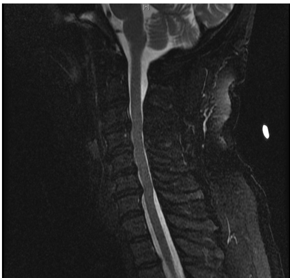
Figure 1 Sagittal T2-weighted MRI showing narrowing of spinal canal at C3-C7.

On clinical exam, he was alert and oriented in all hemispheres. Cranial nerves II-XII were grossly intact. His peripheral neurological exam revealed decreased sensation to light touch and pinprick in both hands and feet. His muscular strength was 4+/5 in his bilateral deltoids, biceps and triceps, 4/5 in his bilateral wrist extensors, 4/5 in his right finger abductors, 3/5 in his left finger abductors, 4/5 in his bilateral finger flexors, and 4+/5 in his bilateral lower extremities. He showed no pre-operative co-ordination and/or cerebellum abnormalities. Physical examination revealed 3/4 hyper-reflexia in all four extremities. He was Hoffman positive on his right side and Hoffman negative on his left.