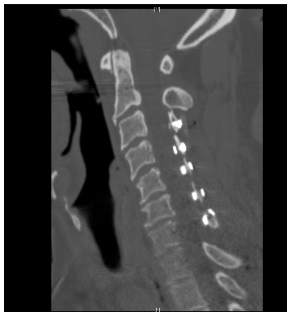
Figure 3 CT (sagittal view) of cervical region showing normal post-operative changes.

having decreased sensory and motor function, despite the lack of a toxic or metabolic process. By the fourth day of hospitalization, he had a significant increase in sensory and motor function and was able to answer questions appropriately. The dissociative states became less frequent and of shorter duration. On the ninth day of hospitalization, our patient was discharged home with full recovery and without any objective neurological abnormalities.