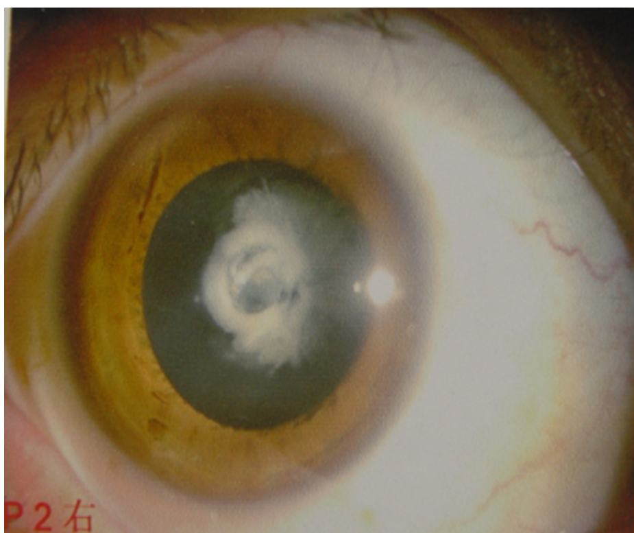
Figure 1. Slit lamp photograph showing nuclear cataract of patient IV:3 from Figure 2.

(Figure 1). Blood was collected from six patients and five other family members. None of the participating patients have any other clinically-related ophthalmic syndromes.