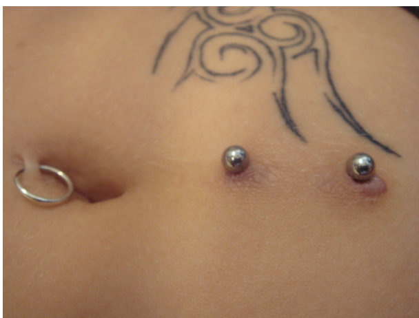
Figure 5 Piercing, tunnelling and tattoo in a 24-year-old female. Skin inflammation at the tunnelling site.

Incomplete earlobe clefts are another possible complication of piercing and the wearing of jewellery in this area. There are