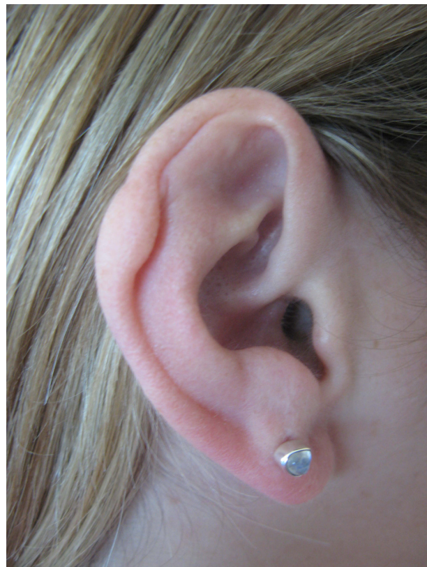
Figure 6B Seven years later with destruction of helical cartilage.

surgical and nonsurgical procedures available to deal with this problem. Brazilian authors presented a nonsurgical procedure for incomplete earlobe cleft repair using trichloroacetic acid 90%. They assessed 32 patients with a total of 53 earlobes to be noninvasively repaired. The complete treatment varied from 2 to 50 days with repeated application of trichloroacetic acid 90%. No recurrences were observed during one year of follow-up. All of the clefts were totally repaired, and all