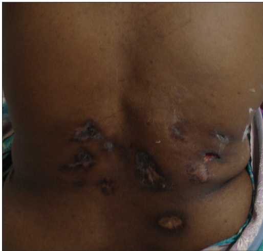
Figure 1: Cutaneous lesions on the back of patient