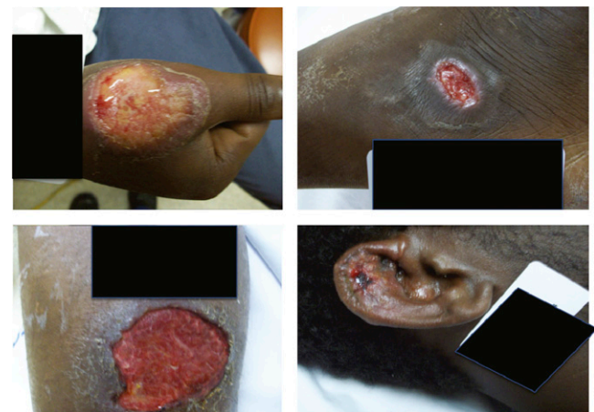
FIGURE 2. Skin ulcers of four patients confirmed to have leishmaniasis caused by Leishmania panamensis . A: Patient 1, 5-cm lesion on dorsum of right thumb. B: Patient 2, 1-cm lesion on right ear. C: Patient 3, 8-cm lesion on right calf. D: Patient 4, 2-cm lesion on lateral aspect of left foot. Patient 5 declined photography. Identifying information is blacked out.