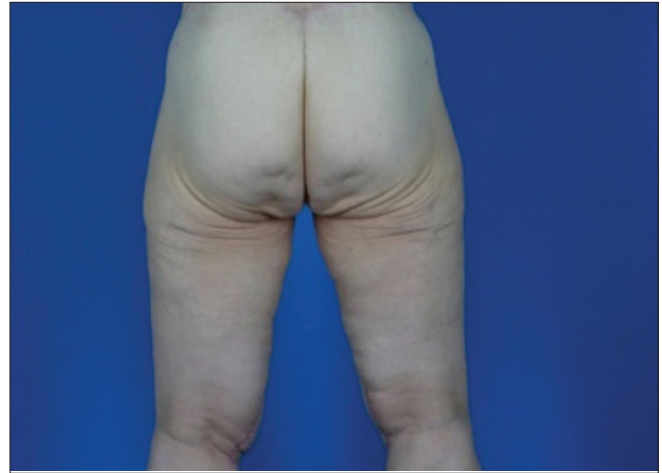
Figure 4: The same patient as in Figure 3 following medial thigh lift. The lower part of the operative scar is seen on the medial aspect of the popliteal crease bilaterally