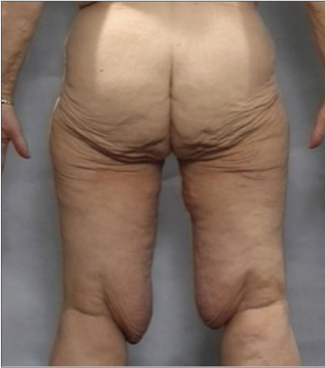
Figure 3: An MWL patient prior to a medial thigh lift