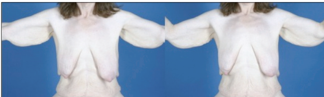
Figure 7: Another patient seen with the typical upper truncal deformities