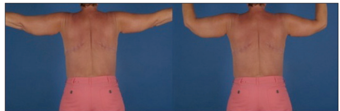
Figure 6: The same patient as in Figure 5 following brachioplasty with improvement in contour. The infrascapular scars bilaterally are those of concomitant back-roll excisions