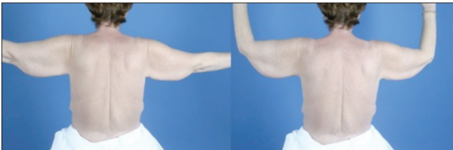
Figure 5: A patient with the typical "bat-wing" deformity bilaterally