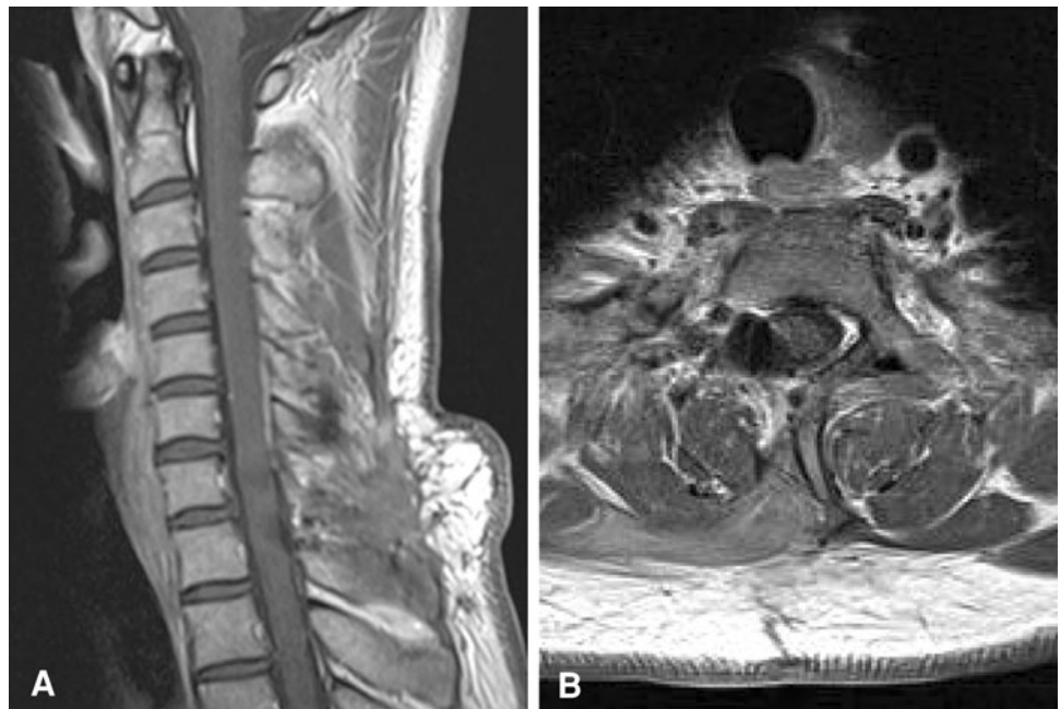
Fig. 3 Postoperative MRI from sagittal ( a ) and axial ( b ) views at 2 years after surgery, showing no residual or recurrent tumor

MRI is the best method for obtaining details of tumor localization and relationships to adjacent structures. Spinal JXG almost always appears isointense on T1-weighted imaging and hyper- or isointense on T2-weighted imaging, and homogeneous enhancement with gadolinium was observed in most reported cases (Table 1). However, a few JXG have been reported as hypointense on T2-weighted imaging [11, 18]. Such relatively low-intensity signals on T2-weighted imaging have been considered to reflect the poor cellular elements of the mass [11, 18]. When a similar signal pattern is observed on MRI, the histopathological differential diagnosis includes fibroma, fibrous meningioma, and solitary fibrous tumor. Intraoperatively distinguishing between JXG and other tumors of neural origin is difficult, and lesions such as schwannoma, neurofibroma, nerve sheath myxoma, malignant nerve sheath tumor, and solitary fibrous tumor must be considered. Histopathological and immunohistochemical methods remain the gold standard for diagnosing JXG. The tumor is typically a round lesion with a yellowish to grayish appearance on the cut surface. Microscopically, a diffuse and/or nodular pattern of growth and a pushing border are apparent at low