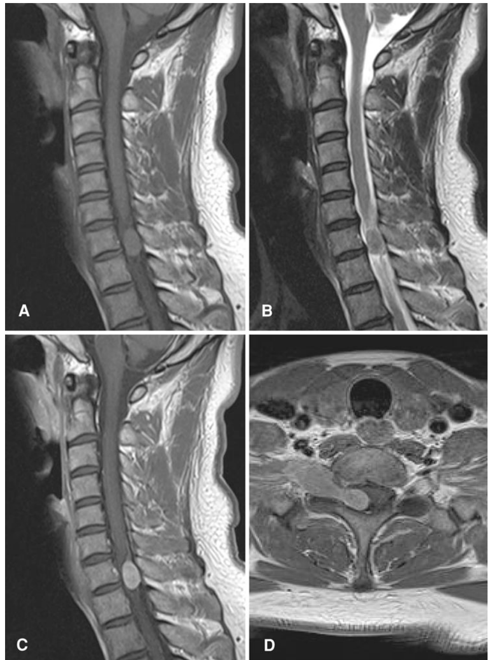
Fig. 1 Preoperative MRI. Sagittal T1- (a) and T2-weighted imaging (b) demonstrate an isointense lesion in the spinal canal. T1-weighted sagittal (c) and axial (d) views with gadolinium enhancement demonstrated a homogeneously enhanced dumbbell-shaped lesion

was resected en bloc and the nerve root was sacrificed. Vascularity of the tumor was not rich.