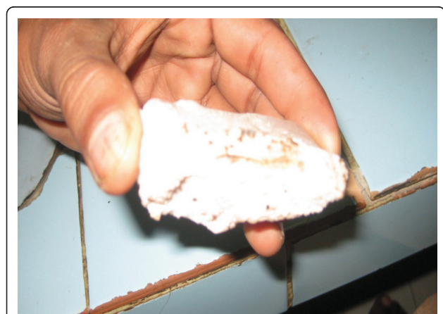
Figure 2 Dark blood spots are visible on potash alum being used at barbers shop.

In Asia and Africa, HIV and hepatitis control and prevention programs are increasingly recognizing the importance of providing infection control and education for healthcare professionals. Such education should focus on the importance of proper sterilization