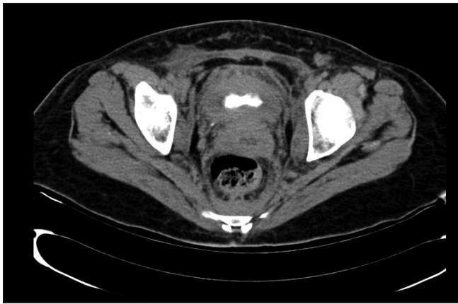
Figure 1: Contrast enhanced computerized tomography suggestive of irregular circumferential moderately enhancing thickening of urinary bladder

Patient underwent chemotherapy in form of paclitaxel and carboplatin. After two cycles of chemotherapy patient started passing urine per urethra and nephrostomy output decreased. So we clamped both the tubes for 48 h and removed both the nephrostomies. After nephrostomy removal patient's serum creatinine remained static at 1.6 mg% and USG showed no hydronephrosis. Patient died after six months due to metastatic disease.